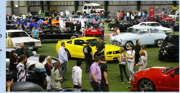
My yellow Mustang at Bílasýning 2010